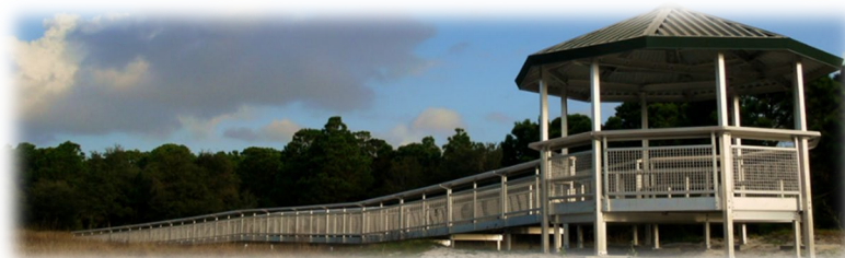
Miramar Pineland Park: A regional park and nature center spanning wetlands, flatwoods and prairie land with a boardwalk and trails.

POLICY R4.6 Broward County shall continue the installation of green infrastructure in recreation sites and facilities. Retrofit and install green infrastructure and water reuse in new Broward County recreation facilities where possible (solar and wind power, etc.).