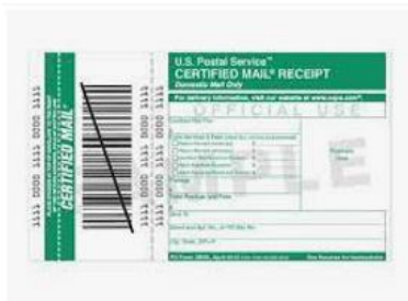
Certified Mail Receipt | USPS.com store.usps.com