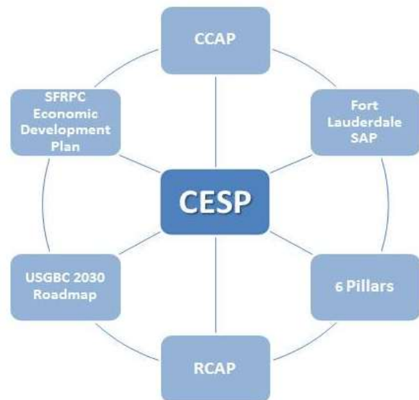
Figure 2 - Local and Regional Plans Assessed for CESP

The Community Energy Strategic Plan (CESP) takes an integrated approach to aligning both regional and local plans and comes out of the Broward County Climate Change Task Force's desire to support the national movement on climate change. Recently, Broward County government enacted Resolution 2014-054 "supporting President Obama's Climate Action Plan, Congressional action on climate change, continued engagement with the Southeast Florida Regional Climate Change Compact and federal government, adding goals for using renewable energy, reduction of energy usage, and incorporating renewable energy projects into buildings and operations." The Resolution which passed on February 4, 2014, sets goals for 20% use of energy from renewable energy sources and for 2.5% annual improvements in the energy efficiency of County buildings by 2020. To advance the resolution, a Broward County Renewable Energy Action Plan was developed to advance and encourage future renewable energy projects within county operations symbiotically with the CESP. Both plans support Broward County goals through reduction in total energy use, and in furtherance of the community's greenhouse gas (GHG) targets.