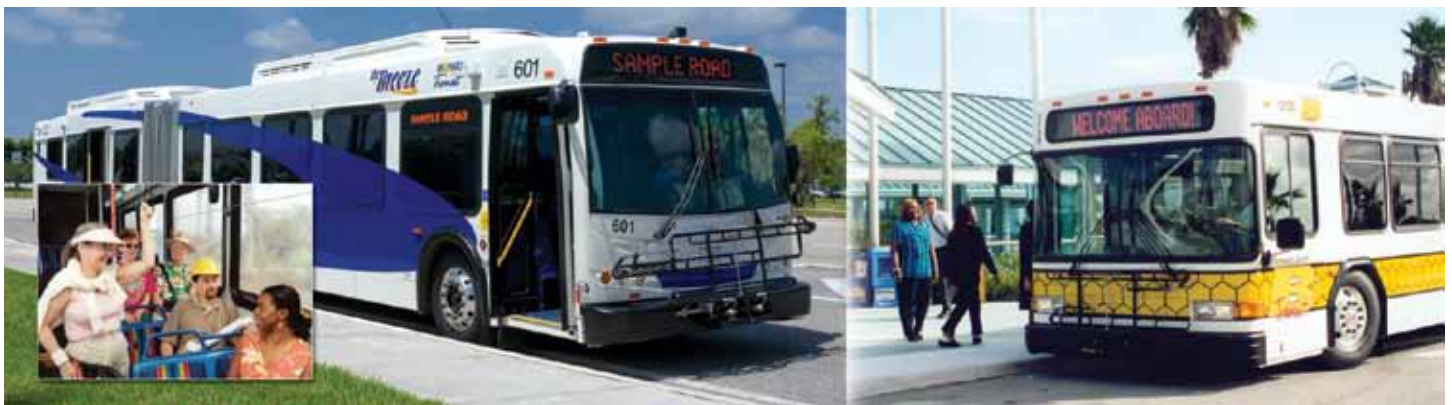
Give Your Car a Break - Leave your car at home. Walk, bike, carpool, or use mass transit.