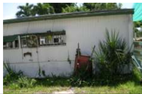
After: View after the horse manure and bedding were removed.