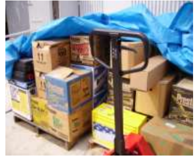
Pre-packaged containers of automotive fluids located to the east of the building observed outside secondary containment.