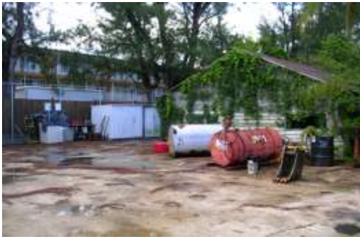
Before: View of hazardous materials that are not situated within secondary containment.