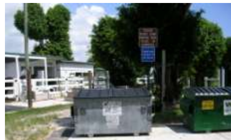
After: View of closed container and proper disposal. An additional sign was posted indicating that the lid should be closed at all times.