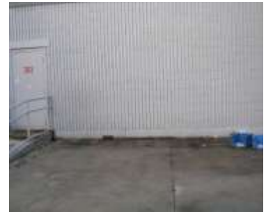
View of the same area with no automotive fluids located outside secondary containment.