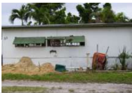
Before: View of horse manure and bedding located on the soil.