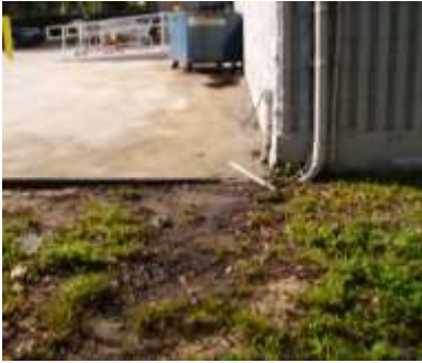
View of used oil staining observed on the concrete surface and on the soil during the September 18, 2006 morning inspection.