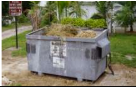
Before: View of manure and horse bedding scattered on ground. The lid of the dumpster is open.

reviewed (3 rd quarter of 2007) there were detections of Nitrate and Phosphorous that did not exceed the Florida Groundwater Cleanup Target Levels for those chemicals.