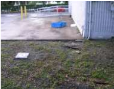
View of the same area with no oil staining.