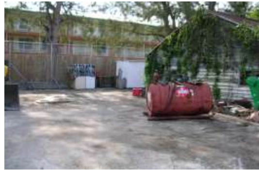
After: View of same area with no hazardous materials storage outside secondary containment.