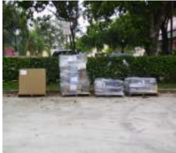
Used batteries located to the east of the southeast corner of the building observed outside secondary containment.