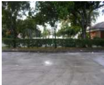
View of the same area with no batteries located outside secondary containment.