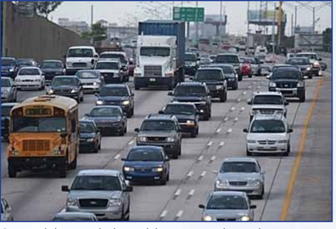
Cars, truck, buses and other mobile sources are the number one source