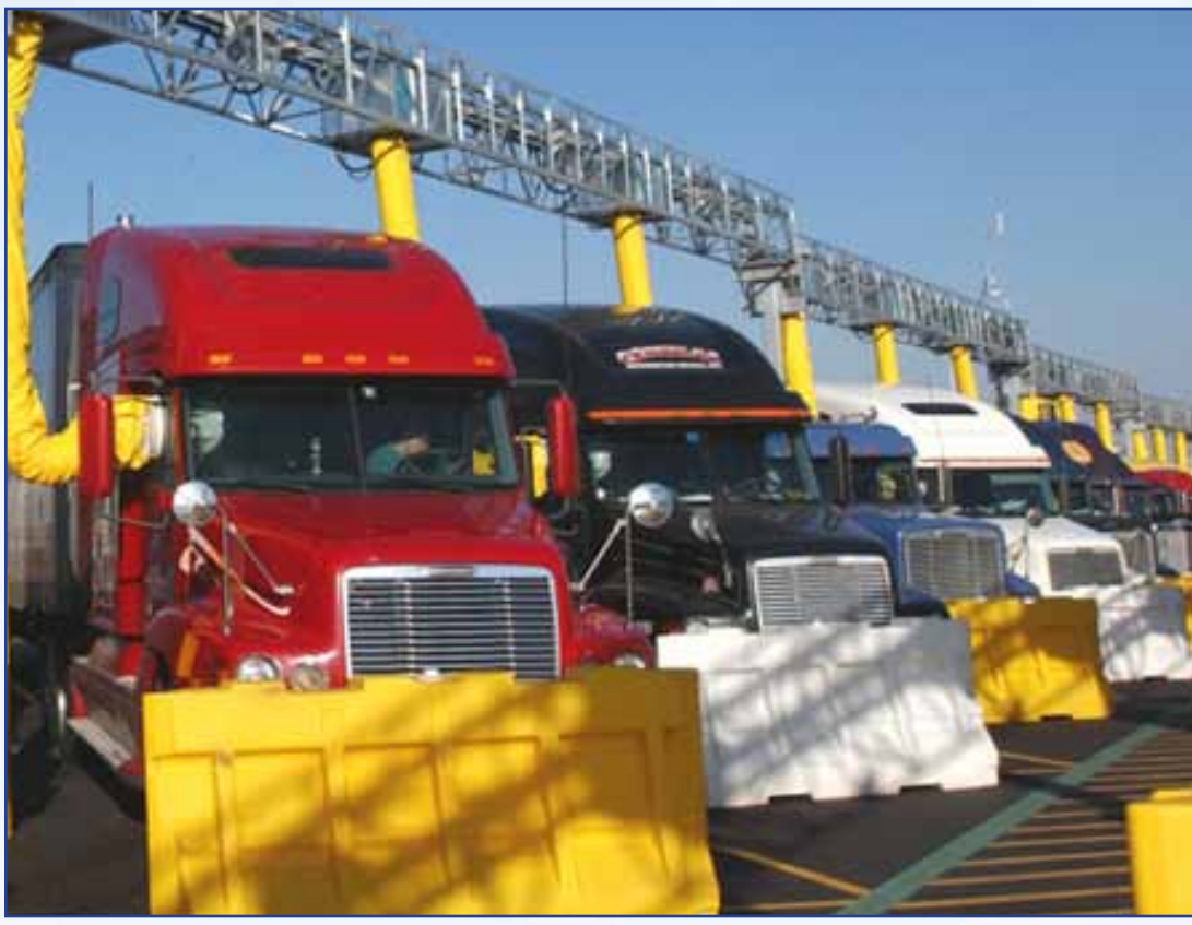
Truck Stop Electrification is to be one of the most attractive and promising activities to reduce diesel emissions from the on-road vehicle sector

Electrification refers to a technology that harnesses an electrical system to provide the truck or locomotive operator with climate control and other needs, eliminating the need to idle the main engine. It can be a stand-alone system or it can include a combined on-board and off-board system.