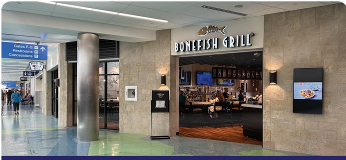
First Bonefish Grill to open in a U.S. airport (Terminal 3)