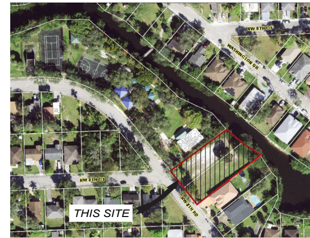
LOCATION MAP N.T.S.

2817 N.W. 8th Rd. Fort Lauderdale, FL. 33311