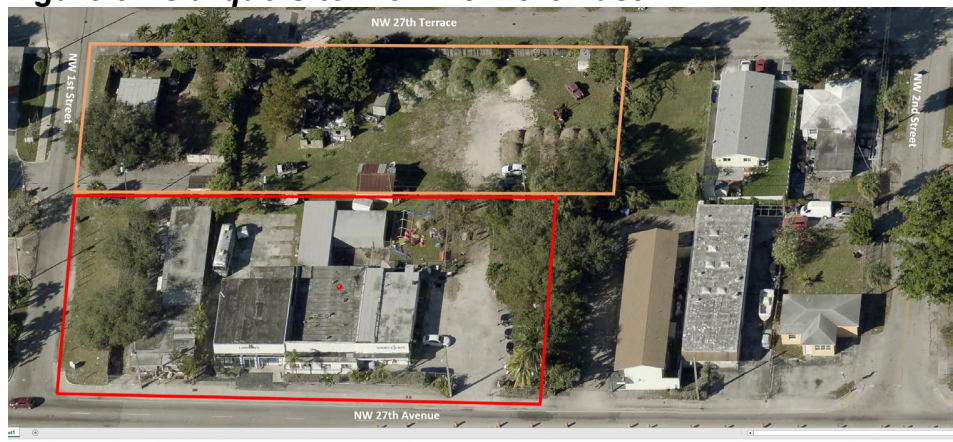
Figure 3: Oblique Site View from the East