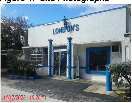
Figure 4: Site Photographs