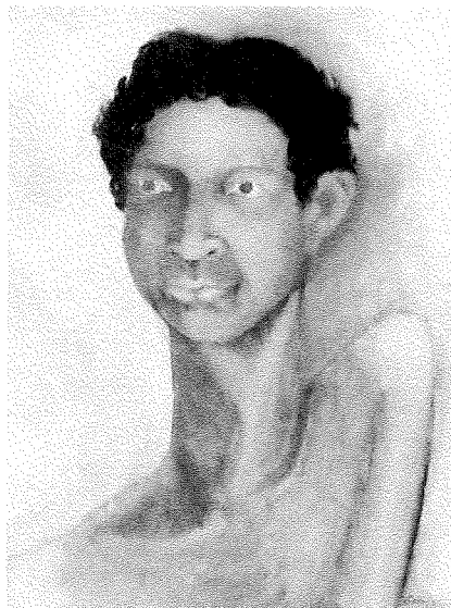
Garry Mabour, Innocente , 22"x 28", 2002