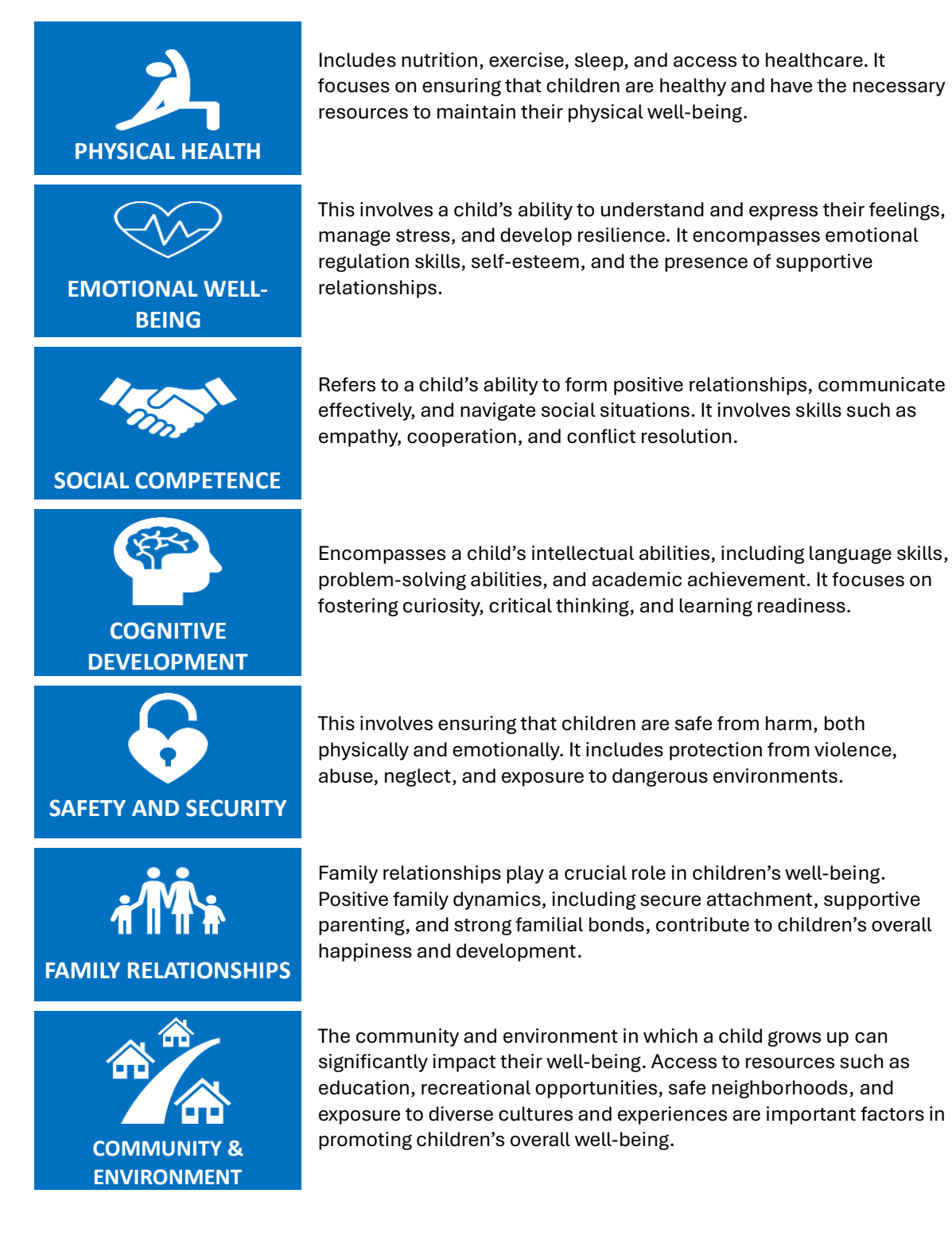
Figure 1. Seven Domains of Well-Being

CSA adopted seven domains of well-being to inform strategic funding priorities.