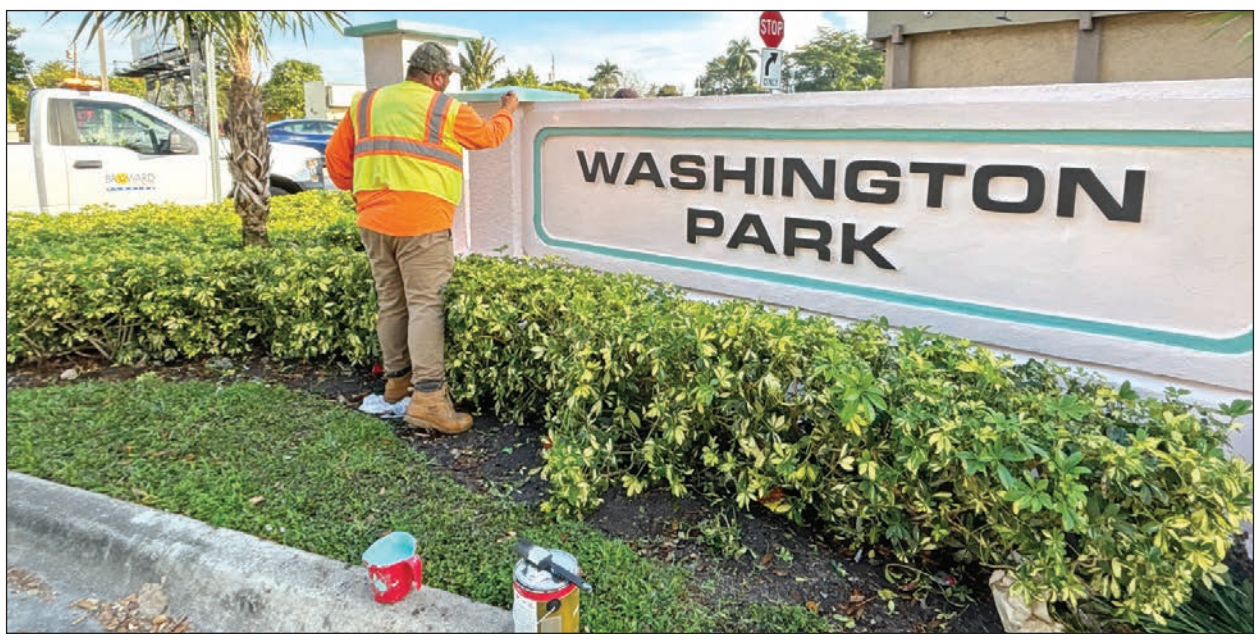
Pictured above HBMD pressure cleaned, made minor repairs, and repainted entrance signs in Broadview Park, Washington Park, and Roosevelt Gardens.

Sidewalk improvements, ADA-accessible pedestrian curb ramps, and swale improvements were done in Franklin Park and Washington Park.