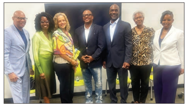
Pictured above are Neighborhood Revitalization Symposium panelists.

OESBD participated in numerous events and sponsored economic development activities in the Broward Municipal Services District (BMSD) the first half of 2024. Events included business skills classes, site visits, micro-grant training sessions, and public forums. The various events raised awareness, expanded opportunities for education and outreach, as well as contributed to district vibrancy.